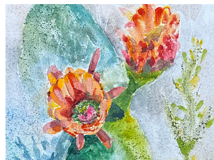
Colleen Gianatempo / Desert Claret